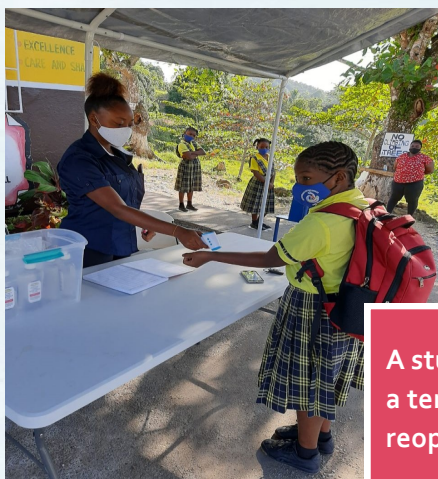
A student of the Chatsworth Primary and Infant School, St James doing a temperature check in keeping with the new protocols for the reopening of selected schools to have face-to-face teaching.

Ultimately, in producing high-quality work, the PDD helps the Ministry to meet the needs of our stakeholders and the wider public with the hard data that can guide informed decision-making and policy development.