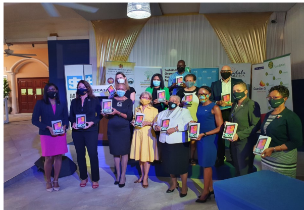
Education, Youth & Information Minister, Honourable Fayval Williams (3rd left, front row) launched the One Laptop or Tablet Per Child Initiative designed to promote inclusivity in the education sector. With the engagement of stakeholders, the Government is seeking to provide 100,000 non-PATH students with devices to participate in electronic learning. Picture here are representatives from the Jamaica Stock Exchange, Private Sector Organization of Jamaica, NCB Foundation, Jamaica Teachers' Association, Sandals Foundation, Seprod Foundation, Guardian Life Limited, Ernst & Young Chartered Accountant, among others.

4 November is Youth Month! Theme: reTHINK - (Resilient through Entrepreneurship, Training, Hope, Innovation, Networking and Knowledge). The youth arm of the MoEYI was a buzz on Sunday, November 1 at the Emmanuel Apostolic Church as Minister Robert Nesta Morgan launched Youth Month 2020 and