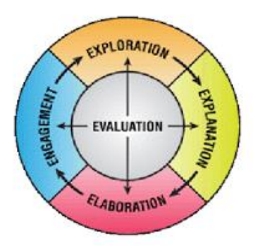
Figure 1. A version of the 5E model that conveys the role of evaluation as an interconnecting process that is at the core of the learning experience.