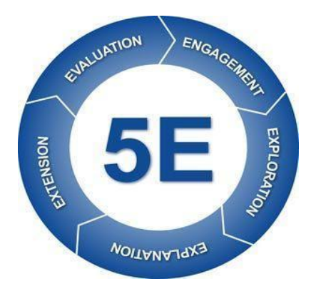
Figure 2. The cyclical perspective of the model with each process being given similar emphasis in contributing to the learning experience on a whole.